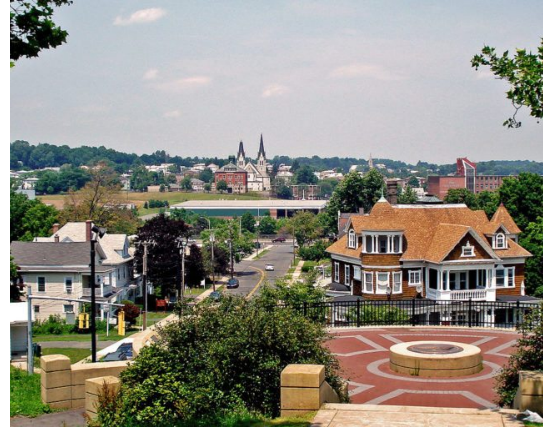
New Britain, CT

Charter Oak State College is located in New Britain, Connecticut and offers students several ways to accelerate their degree programs with prior learning assessment (PLA). With PLA students are able to gain college credits for professional experience, military experience, work or volunteer experience, and previously earned credits or certificates. Associate of Arts and Associate of Science degrees are available in General Studies, bachelors degrees offered are in Business Administration, Cyber Security, Health Care Administration, Health Information Management, Psychology, and General Studies, each with different electives and/or concentrations to choose from. A masters degree program in Organizational Effectiveness & Leadership is also available through Charter Oak State College.